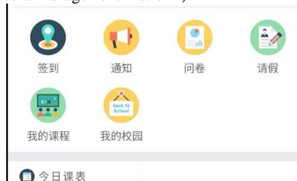
Figure 2 New media management platform for college students

The shaping of the cultural environment can not be ignored. The environment can produce the extremely strong appeal to the person, can have the important influence to the human life and the study. Creating a cultural environment in colleges and universities will promote the effective development of education [2]. The change of people's thought is inextricably linked with the environment, which can enlighten people's thought and influence people invisibly. The environment stimulates the human thought, has played the guidance function to the human behavior, at the same time, the human also may use own behavior to transform the environment, therefore, the human and the environment is mutually interacts, complements each other. In the construction of the cultural environment, the education workers focus on the core values and present the relevant contents in the environment to promote the truth, goodness and beauty. Students are more able to establish correct values in a culture of integrity. College educators in the shaping of moral and cultural environment, but also play the role of class management system, ask college students to participate in the establishment of the system, can get the recognition of students, in the daily school activities strictly abide by, at the same time, students have a deep sense of core values and recognition.(Figure 2: University Student New Media Management Platform)