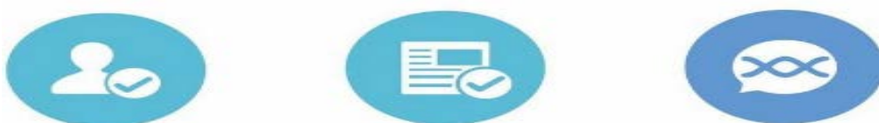
Figure 3 College students' WeChat public platform

Nowadays, college students are more accustomed to using new media technology, such as WeChat, QQ and so on are important ways to get information. In carrying out the education management work for college students, we should make full use of these technical software to establish close communication relationship with students, pay attention to the students' network signature and message, so that the students can understand the problems in time, and carry out psychological counseling to the students with pertinence [3]. Using the correct way of communication to guide the students' education can make the educational management get twice the result with half the effort. Compared with face-to-face communication, this kind of communication is more easy for students to open their hearts and make problems solve effectively and avoid repetition.(Figure 3: University Student WeChat Public Platform)